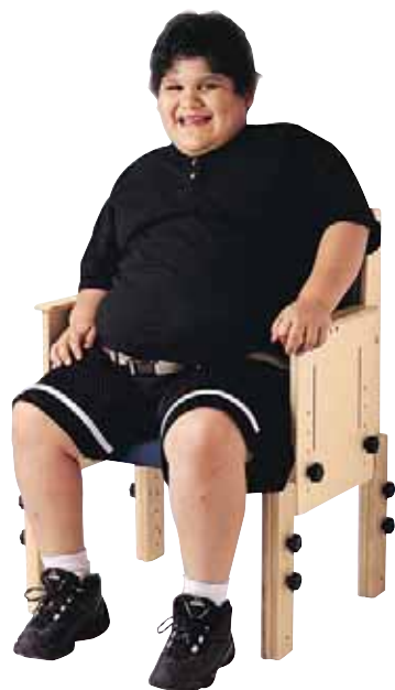
SCHOOL CHAIR X-WIDE

The TherAdapt® School Chairs come standard with a 1" pelvic positioning belt, and feature a height and depth adjustable slip-resistant, padded seat. The chair can be ordered with either a flat seat or a 10° anterior angle seat to promote therapeutic positioning and aid in independent transfers. All of the Wide and X-Wide School Chairs are reinforced with a steel support bracket under the seat.