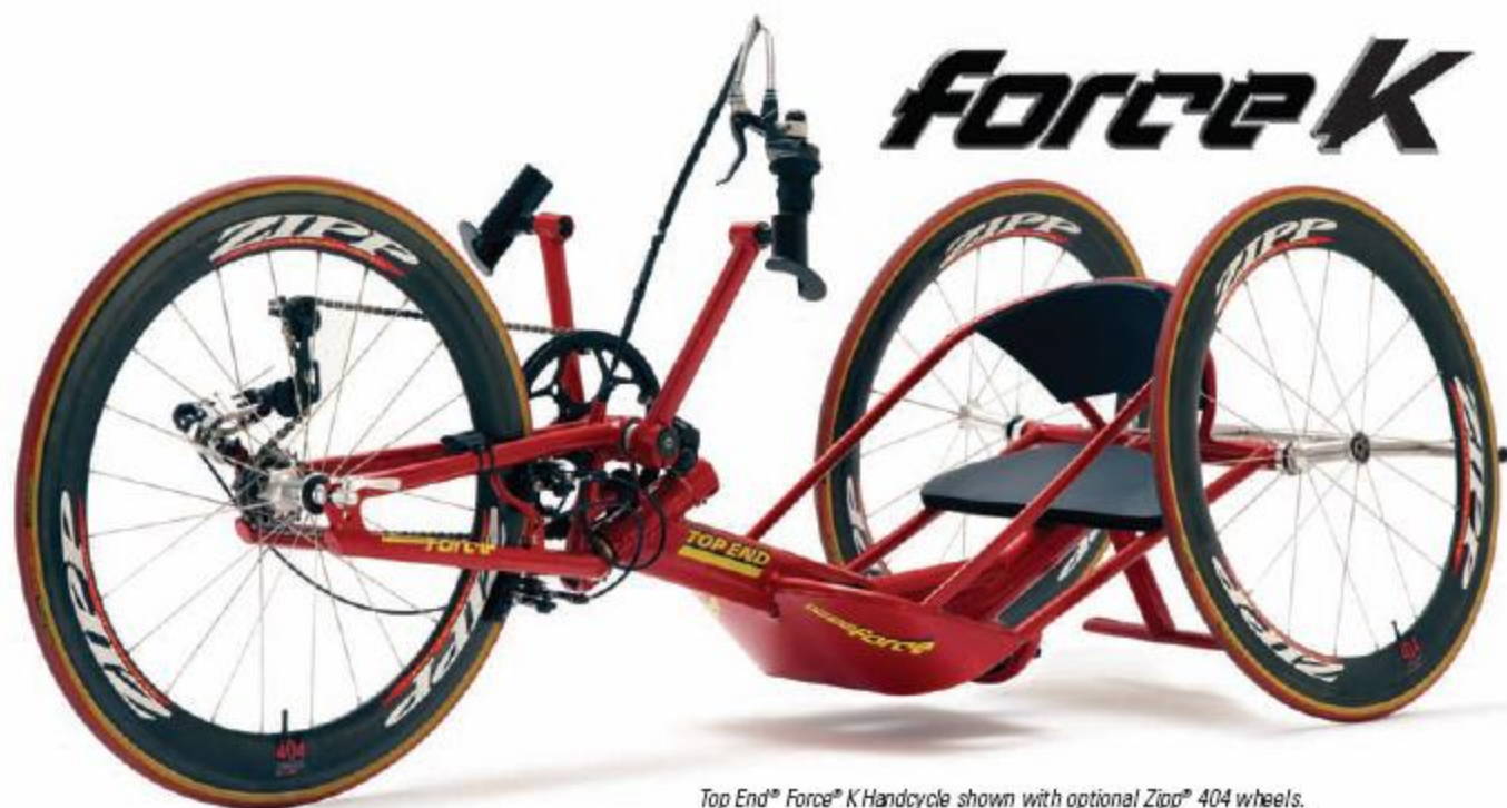
Top End® Force® K Handcycle shown with optional Zipp® 404 wheels.

Can you force the pace? Yes, you can®. Get the Top End Force K. You will be a missile.