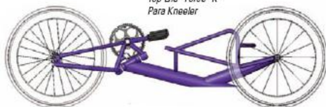
Top End® Force™ K Para Kneeler