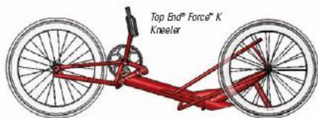
Top End® Force™ K Kneeler