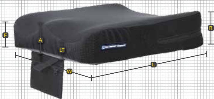
*SEE CHART FOR DIMENSIONS