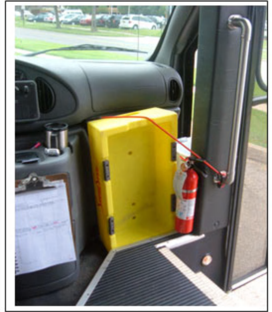
The 6 inch tall Senior Step stores safely under seats or straps in easily for storage