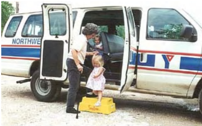
The 6 inch tall Senior Step for buses & trains

“The Shure-Step® gives our customers a less expensive purchase option to the mounted hydraulic step that get torn up easily when the bus gets too close to a curb.”