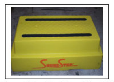
Smooth top for Shure-Step® II

The Shure-Step® II is the only step model that comes with 2 different top surfaces. One is a very rough diamond plate pattern that is designed to be used in "dirty" work places. Should the top surface get oil, grease or grime on it, the user will not experience any slippage as long as he/she is wearing some type of safety shoes with good tread on the sole.