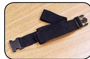
EHS - Details On Page 52 M.S.R.P. - $50.00