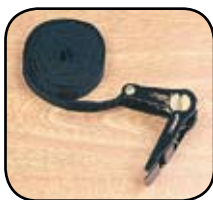
ERS - Details On Page 52 M.S.R.P. - $50.00