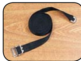
ESS - Details On Page 52 M.S.R.P. - $20.00