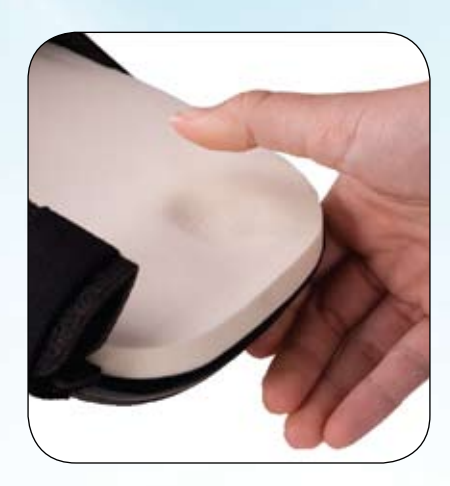
Soft Auto-mold<sup>™</sup> sole cushions the foot while preventing unnecessary movement