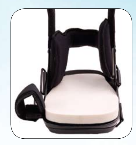
The flatform innersole maintains neutral joint position