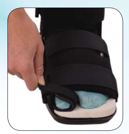
The innovative pad-and-band holds the toe in position with constant gentle pressure, and separates the second toe

Available S-L With or without Ankle Air Bladder* AL25800 x