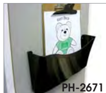
Chart Holder on Left Side