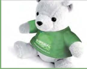
Cuddly Kerri Bear (5" - child safe materials) ITEM NO. PH-2670