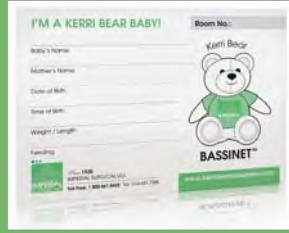
Kerri Bear Specialty Cards for Basket Card Holder ITEM NO. 10124: 100 cards per bag