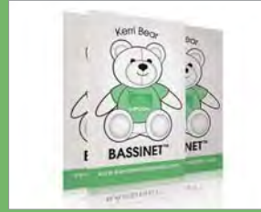
Kerri Bear Decal 1.56" x 2.5" ITEM NO. 10125: 200 Decals