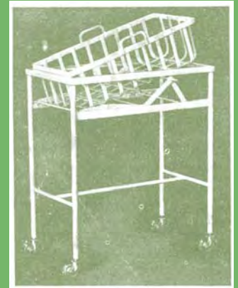
Circa 1950 Imperial catalogue.

For more information, please visit www.surgmed.com (and click on the Imperial Surgical link)