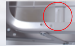
Patent pending rail slot