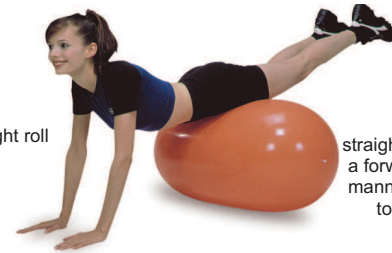
C straight roll

straight roll only moves in a forward and backward manner making it easier to use than a ball