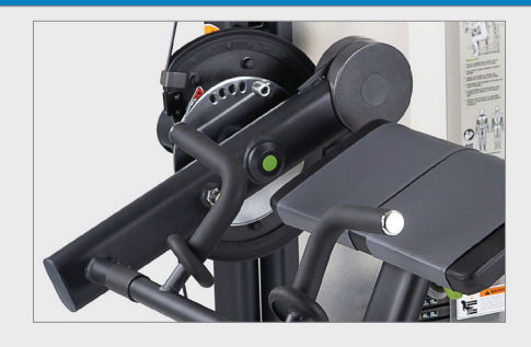
Dual cam system improves biomechanics and reduces cable slack