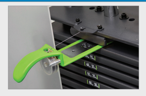
Stacks feature sound dampeners and magnetized selector fork for maximum stability