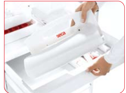
The measuring mat can be rolled up for space-saving storage.