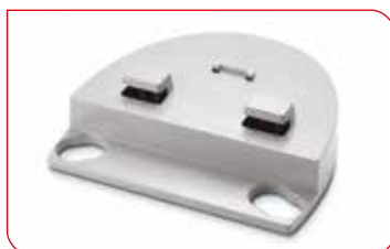
The seca 437 adapter element connects the stadiometer to a flat scale.