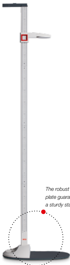
The robust base plate guarantees a sturdy stance.

The large and stable head piece ensures highly accurate results. It is made of a firm non-warping plastic that smoothly glides into place. Another well-designed detail is found in the two-sided scale on the rod which permits a readout of results during the measurement process and guarantees precise measuring up to a height of 205 cm.