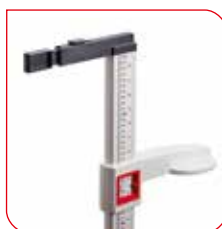
The spacer provides extra stability and ensures precise measurement results.