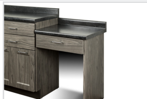
076-FP Desk/postform top