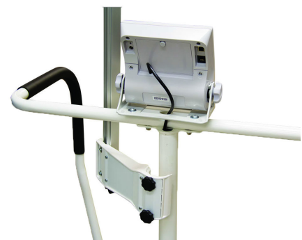
Figure 3. Secure Height Rod Assembly