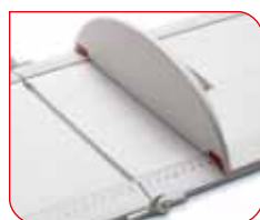
The measurement results are easy to read from the large scale.

A hinge joins together the two parts of the seca 417 measuring board. It has an integrated head piece and a separate foot positioner that smoothly runs along the gently raised guide rail. For a precise measurement, all the user has to do is place the head of the child against the head piece, stretch out the legs and move the foot positioner to the soles of the feet.