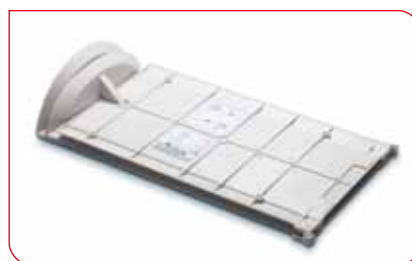
The high-quality folding mechanism guarantees a long service life.

The seca 417 stadiometer is ideal for mobile use. During regularly scheduled examinations, medical personnel check the nutritional condition and development of infants and toddlers. The process should go quickly, so it's important to be able to read results easily. The red markings and high-quality printing of the scale don't fade even after years of intense use.