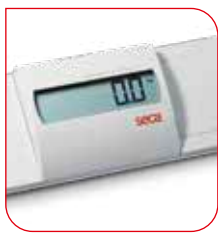
The patient's BMI can be determined when their height is entered.

The low platform profile reduces patient effort and risk when stepping on the scale. As the 22 x 22 inch platform is almost twice as large as that of a normal scale, a chair may also be placed on the scale for weighing a patient. With the pre-TARE function, the weight of a chair or standing aid can simply be tared away. Up to 3 TARE weights (e.g. chair weights) can be stored.