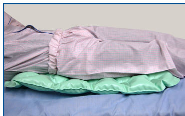
On the Bed