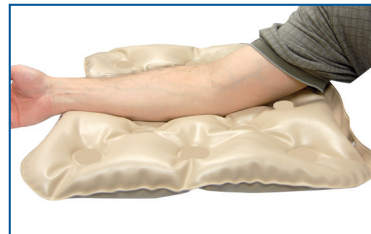
Under the Elbow