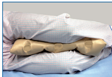
Between The Legs