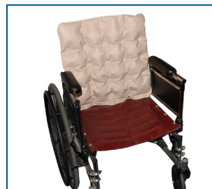
On the Back of the Wheelchair