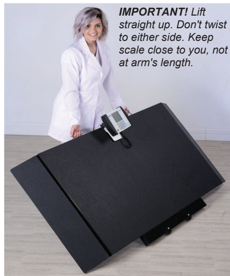
Lifting from or Lowering Scale to Floor (Storage Position)

IMPORTANT! Lift straight up. Don't twist to either side. Keep scale close to you, not at arm's length.