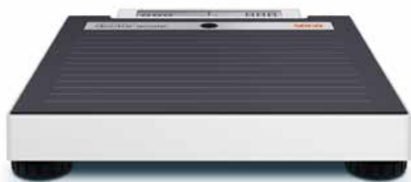
The flat construction and non-slip tread make it stable and comfortable to step onto.

A good name is earned through quality and modern functionality. That is why the seca 874 dr has been labeled the "doctor scale". It indicates the value of the product while reflecting the professionalism of the user. The label gives users certainty about the precision of the measured values and can be exchanged for personalized messages. Further information can be found at www.seca.com/doctorscale .