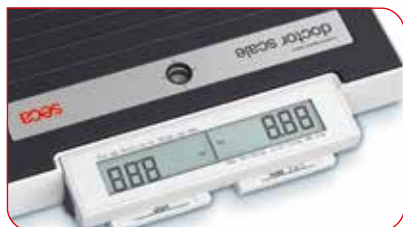
The two buttons on the front side of the scale can be easily operated by foot.

You can also access the website via this QR code: