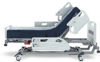
ENTERPRISE® Bed frame