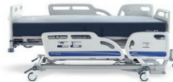
CITADEL PLUS Bariatric bed frame