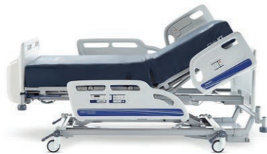
CITADEL Bed frame