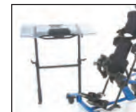
PT50146 Oversized Tray with Swing-Away Front

Allows the tray to swing away providing more room for front transfers. Tray size is 21"x24" (53x61cm). Not available with Mobile option.