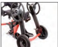
PT50177 Tall Mobile

Allows self-propulsion while sitting or standing. Push rims adjust forward and aft. Mobile footprint 24"x38" (61x97cm). Push rim height 31" (79cm) from floor. Not available with Trays or Front Swivel Casters.