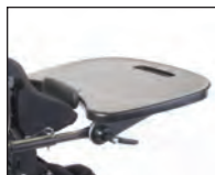
PT50074 Black Molded Shadow Tray

Assists caregiver in moving seat from sitting to standing, by providing an extension to the current handle. Useful with the gas spring assist lift for smaller users.