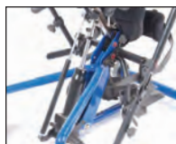
PT50020 Hydraulic Actuator w/Removable Handle

Brings the user to the standing position with the touch of a button. Includes light touch controller, rechargeable battery and charger, Linak® actuator and an emergency release.