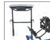
PT50148 Black Molded Tray with Swing-Away Front

Shadow tray is accessible in all positions and provides anterior support as user moves from sitting to standing. Adjustable in depth, height, and tray angle. Tray size is 21"x24" (53x61cm). Not available with Mobile option.