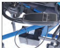
PT50022 Pow'r Up Lift

Allows self-propulsion while sitting or standing. Push rims adjust forward and aft. Mobile footprint 24"x38" (61x97cm). Push rim height 35" (89cm) from floor. Not available with Trays or Front Swivel Casters.