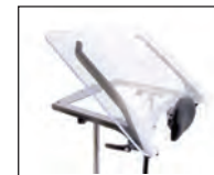
PT50190 Oversized Angle Adjustable Tray with Swing-Away

Adjusts from 0-35° to provide forearm support and angle activities closer to the user. Tray size is 21"x24" (53x61cm). With the swing-away front. Not available with Mobile option.