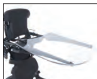
PT50076 Clear Shadow Tray

Shadow tray is accessible in all positions and provides anterior support as user moves from sitting to standing. Adjustable in depth, height, and tray angle. Tray size is 21"x24" (53x61cm). Not available with Mobile option.