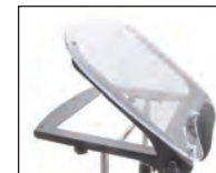
PT50188 Clear Angle Adjustable Tray with Swing-Away

Allows the tray to swing away providing more room for front transfers. Tray size is 29"x22" (74x56cm). Not available with Mobile option.