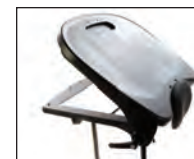
PT50186 Black Molded Angle Adjustable Tray with Swing-Away

Adjusts from 0-35° to provide forearm support and angle activities closer to the user. Tray size is 21"x24" (53x61cm). With the swing-away front. Not available with Mobile option.