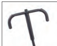
PNG50070 T-Style Handle Extension

Attaches to the actuator handle for users with limited dexterity. Adjusts for various hand sizes. Not available with Pow'r Up Lift. Hydraulic actuator required.