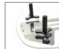
PNG50042 Hand Grips

Adjusts from 0-35° to provide forearm support and angle activities closer to the user. Tray size is 29"x22" (74x56cm) Not available with Mobile option.