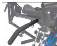
PT50140 Assist Handle Extension

Attaches to the actuator handle for users with limited range of motion. Makes the first few pumps easier and descending more accessible. Adds additional 7" (18cm) in each direction. Not available with Pow'r Up Lift. Hydraulic actuator required.