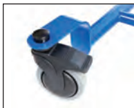
PT50116 Front Swivel Casters

Allows the Bantam to be used as a supine or sit-to-stand stander. User can be transferred in flat-to-load, seated, or hip-knee flexion position. Adjusts from 0-90° supine. Head support required.