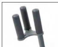
PNG50044 Quad Grip Handle Extension

Allows the user to independently transition to standing with a manual hydraulic actuator. Handle is adjustable and removable. Replaces gas spring lift.