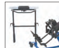
PT50144 Clear Tray with Swing-Away Front

Allows the tray to swing away providing more room for front transfers. Tray size is 21"x24" (53x61cm). Not available with Mobile option.