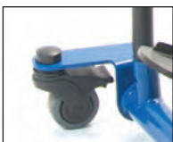
PT50170 Front Swivel Casters for Swing-Away Front

Locking casters allow for easier steering and movement of stander. Replaces front wheels. Extends footprint of the unit to 30"x38" (76x97cm). Not available with Mobile option.