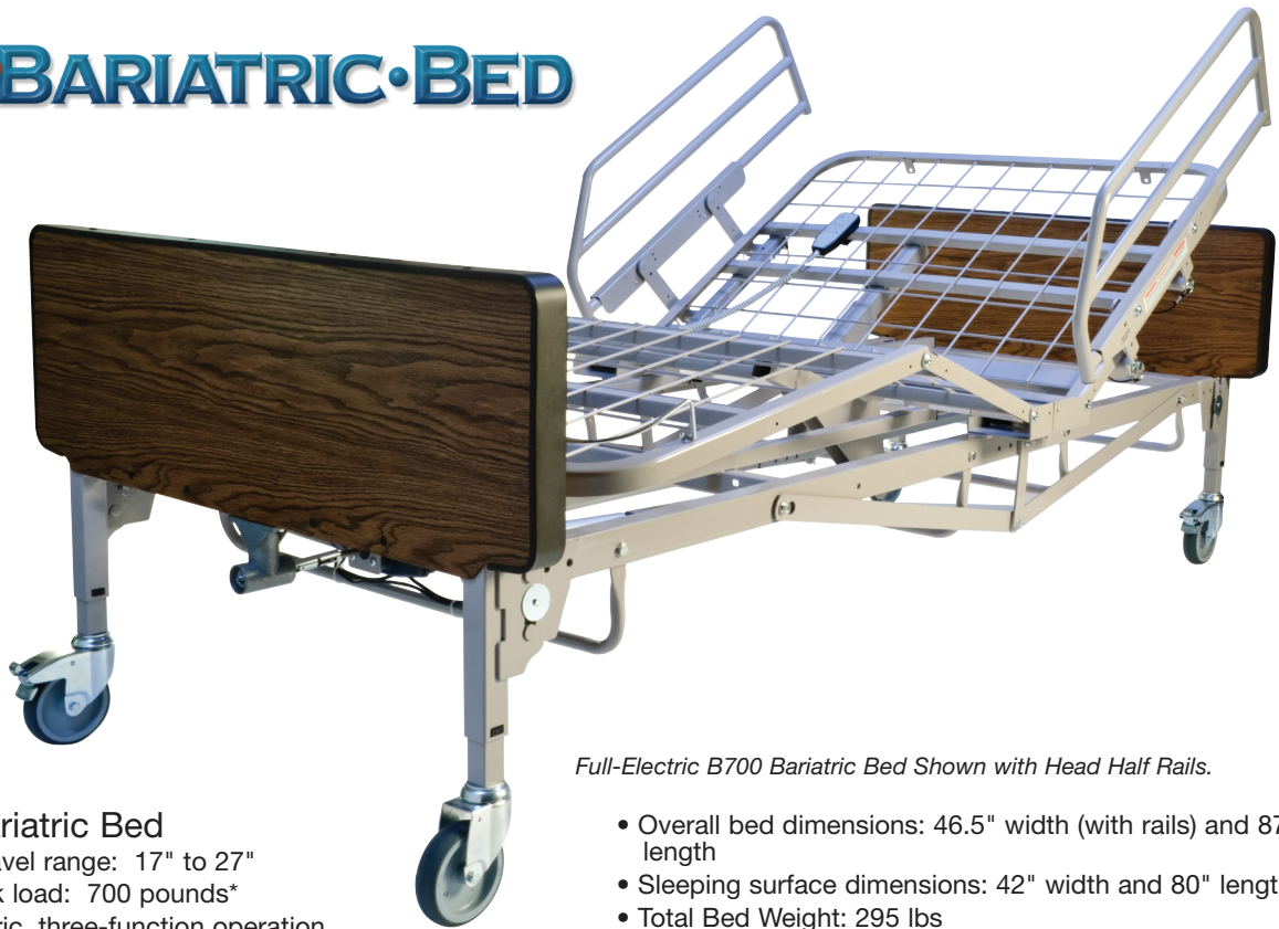
Full-Electric B700 Bariatric Bed Shown with Head Half Rails.