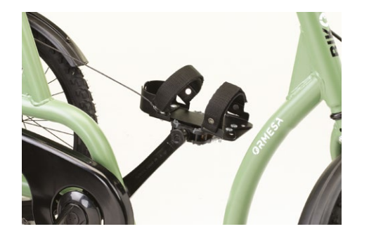
841 Pedal cage with lenght and width adjustable foot imprints and fastening straps, with support kit. It can be ordered per piece.