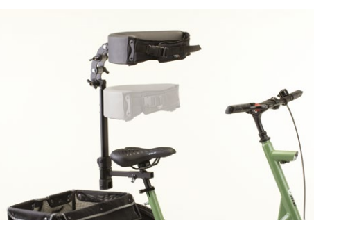
842T Multi-adjustable Trunk support with belt* and joint. Adjustable in inclination, in anterior-posterior direction and in height thanks to 883