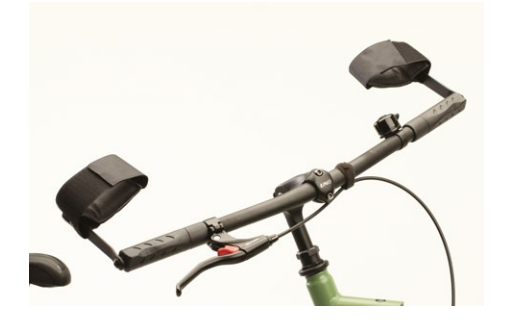
845 Forearm support It supports the forearm. It can be ordered per piece.

Make a binding to the handlebar in case of an ineffective grip, it can also be used individually. With reflective details and easily removable for washing.