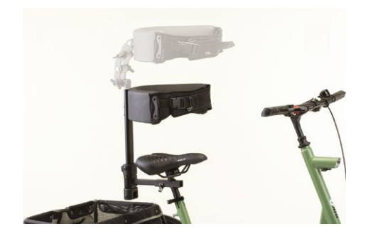
842P Pelvic support with belt*. Height adjustable thanks to 883

(for use with the 841 pedal cage). To stabilize the tibiotarsal joint. It can be ordered per piece.