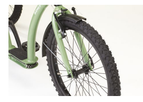
878 MTB tires (3 pcs.) in alternative to standard tyres. Except size mini.

Allows the Care Giver to accompany the child in riding the tricycle by assisting in pushing or slowing down, if necessary, without the ability to direct the handlebar. Easily removable for transportation.