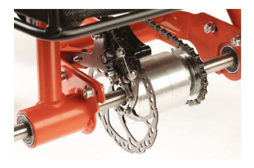
864 Disc brake applicable only on versions with differential and without gearbox.

For sizes M, L and XL. Decreases the distance between saddle and pedal of 3,5 cm and 5 cm/1,3 in and 1,9 in (see sizes pages).