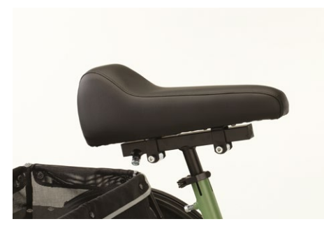
843 Abductive saddle with holder for supports