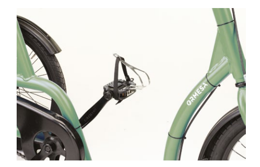
840 Pedal cages with straps. To keep the forefoot positioned on the pedal.