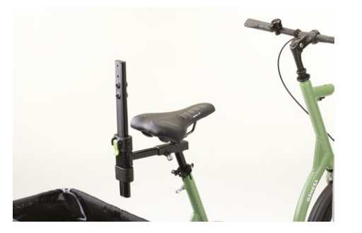
883 Rod adjustable in height for thoracic/pelvic support (single rod).

*Warning: It facilitates balance, but should not be used to support a user who doesn't have any trunk control