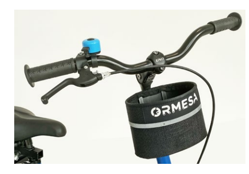
879 Front basket For sizes mini, Small and Medium.