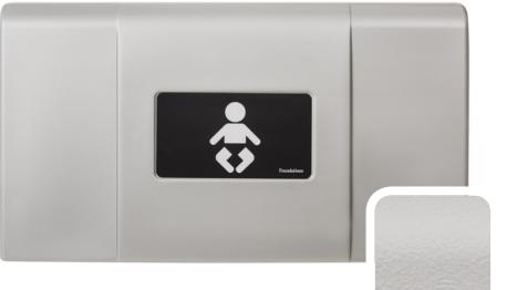
Black & Metallic