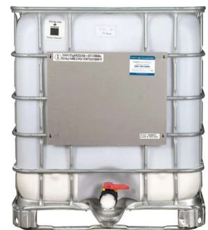
265 GALLON (TOTE)