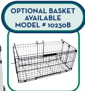
OPTIONAL BASKET AVAILABLE MODEL # 10230B

PATENTED CLOSING DEVICE U.S. Patent No. 6,729,342