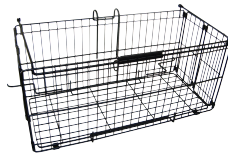
OPTIONAL BASKET AVAILABLE MODEL # 10230B