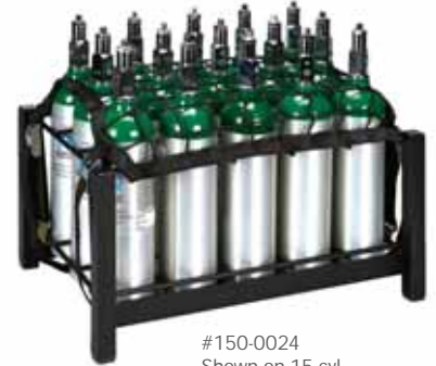
#150-0024 Shown on 15 cyl M6 rack