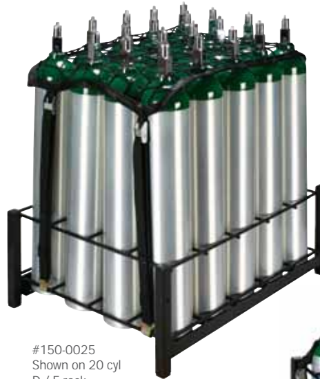
#150-0025 Shown on 20 cyl D / E rack