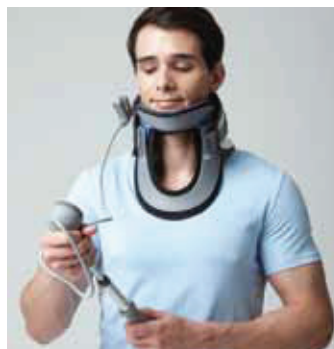
INFLATING THE TRACTION COLLAR