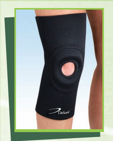
HCPCS Code: L1825