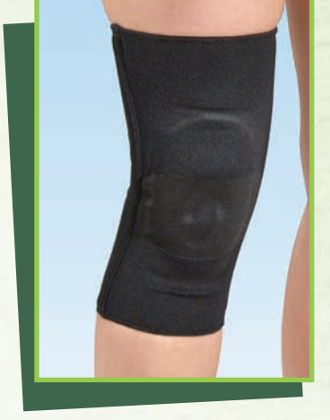
HCPCS Code: L1825