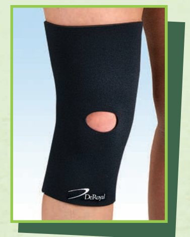
HCPCS Code: L1825

* Measure circumference 6" above mid-patella