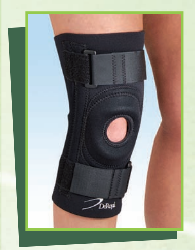
HCPCS Code: L1800