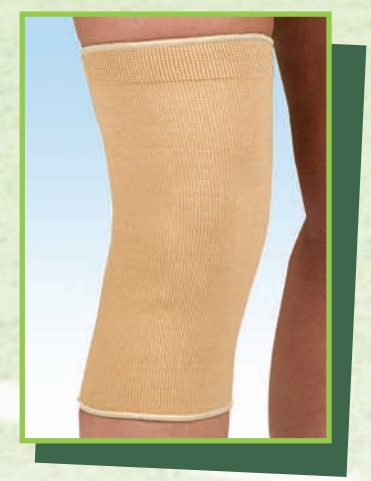
HCPCS Code: L1825