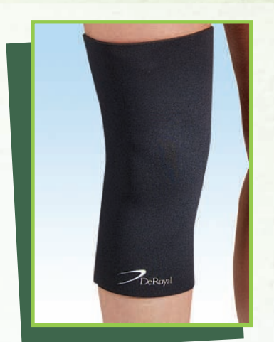
HCPCS Code: L1825

* Measure circumference 6" above mid-patella