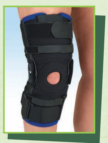
HCPCS Code: L1810

* Measure circumference 6" above mid-patella