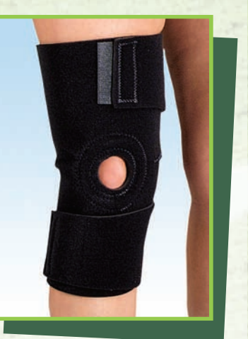
HCPCS Code: L1825