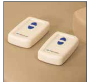
Two easy to use wireless remotes included