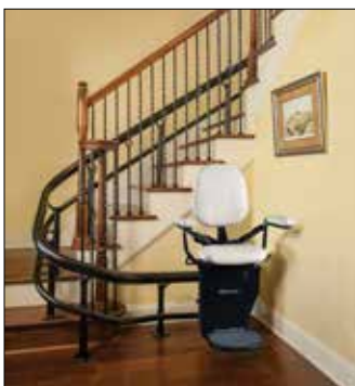
Curved Stair Lifts