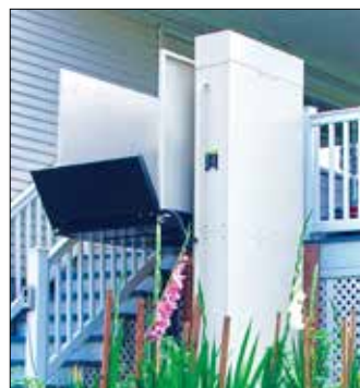
Vertical Platform Lifts