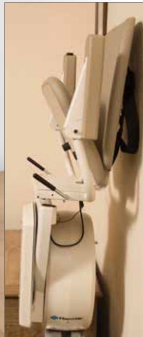
13.6" folded width for more room in your stairwell