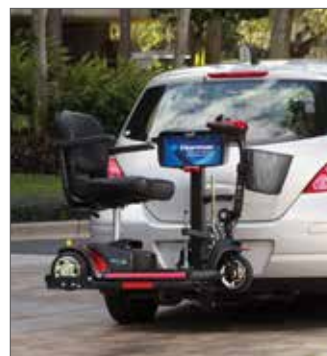
Multiple auto lift solutions for wheelchair or scooter