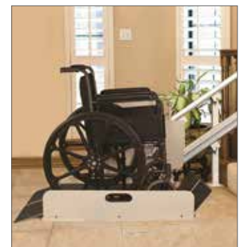
Incline Platform Lifts