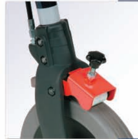
SLOW DOWN BRAKE