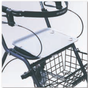
FOOD & BEVERAGE TRAY