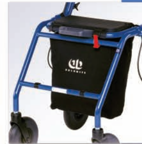
UNDER SEAT BAG

Accessories can enhance the use of your walker – the Tray gives you a platform to carry food, the Oxygen Tank Holder will safely support a B, C or D tank. A Cane Holder can secure a cane or crutch to the side of the walker, Slow Down Brakes have a tension control to allow individual settings for each wheel. One-Hand Brakes can control your braking from one handle. Under Seat Bag gives you a place to stash items out of sight. Tall handles add 3" to the handle height.