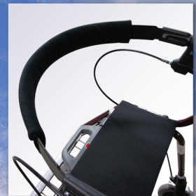
SEAT AND BACK PAD

Accessories can enhance your walker – the Tray can carry food, Oxygen Tank Holder will safely support a B, C or D tank. Cane Holder can secure a cane or crutch on the side of the walker. Slow Down Brakes have a tension control to allow individual settings for each wheel. One-Hand Brakes allow braking from one handle. Under Seat Bag gives you a place to stash items out-of-sight. Handle extensions add 4" height. Large basket for personal items.