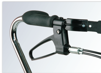
ONE HAND BRAKE