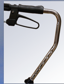
TALL HANDLES MAXI+