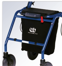
UNDER SEAT BAG