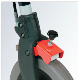
SLOW DOWN BRAKE