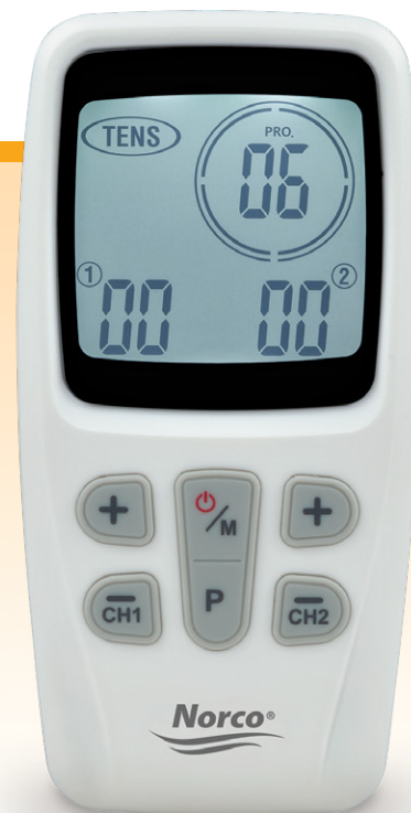
NC89481 Eco-Stim™ TENS + EMS