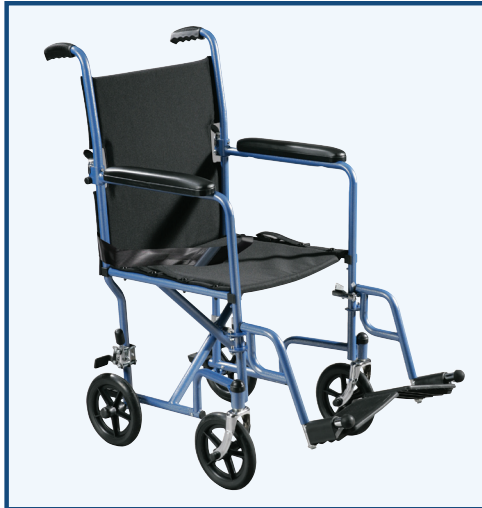
REF. TR37E-BV Shown

weight capacity TR37E: 300 lbs TR39E: 250 lbs