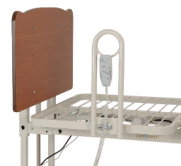
Pivoting Assist Bars