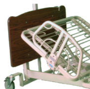
1/4 Length Side Rail