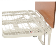
4" Bed Extender