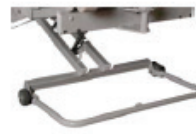
Floor Bumper Guard