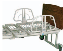
¼ Length Side Rail