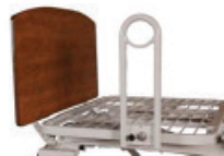
Pivoting Assist Bars