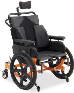
(shown with optional upgrades)