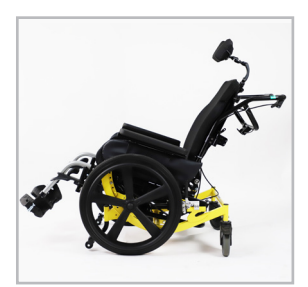
Front pivot seat tilt maintains a proper position for self-propulsion.