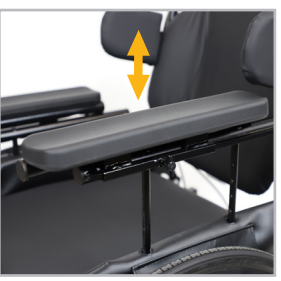
Height-adjustable and removable armrests accommodate a variety of users.