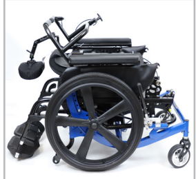
Back canes fold down for easy vehicle loading.