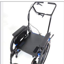
Open seating system allws for almost any padding configuration.