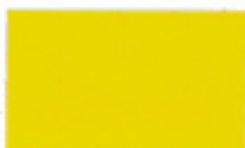
Solar Flame EG12