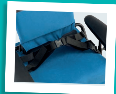
Four-point pelvic harness