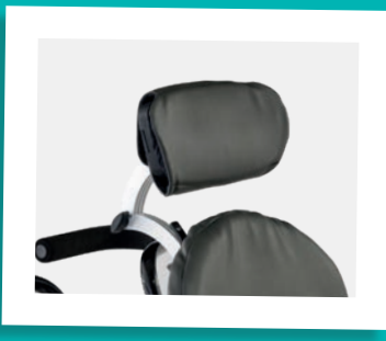
Flat headrest hardware (cover included: Size 1 & 2 only) A contoured headrest will also be available for Size 1 & 2 (not shown)