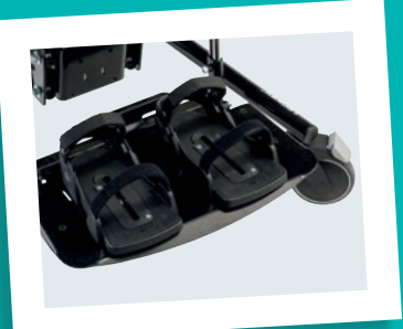
Sandals, including straps Sandal raiser (single, not shown)