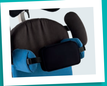
Chest harness (cover included: Size 3 available in black neoprene only)