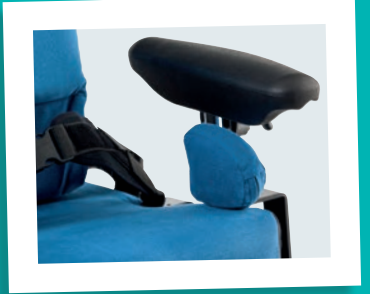
Side abduction pad (cover included: Size 2 & 3 only)