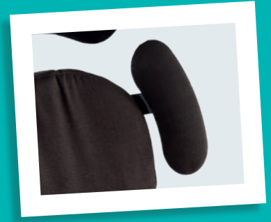
Protraction pads (cover included)