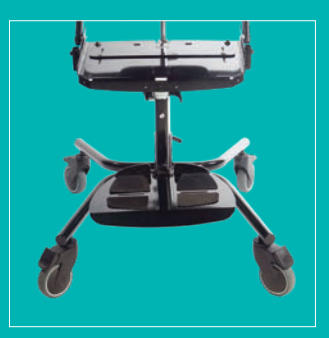
Seat shell on basic chassis with 100mm castors (Size 1, 2 & 3)

Everyday Activity Seat on hydraulic chassis