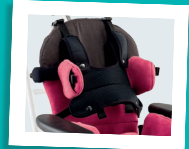
Trunk harness (black)