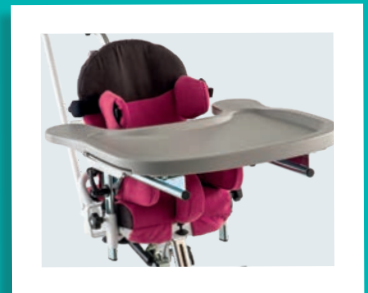
Activity tray (grey)