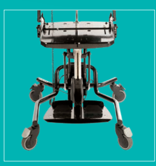
Seat shell on hi-low powered chassis with 100mm castors (Size 2 only)