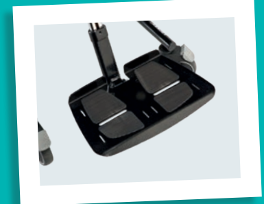
One-piece metal footplate (Size 1 & 2 only)