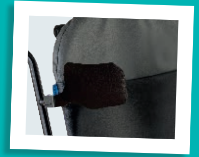
Complex flip-away chest laterals