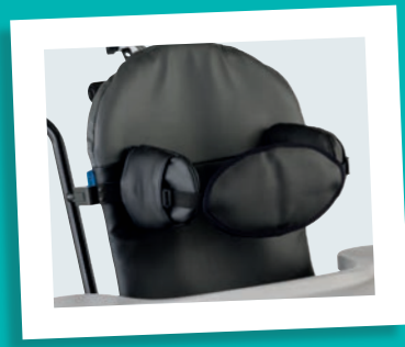
Chest harness (cover included: Size 1 & 2 only)