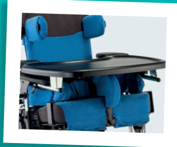
Activity tray (black: Size 3 only)