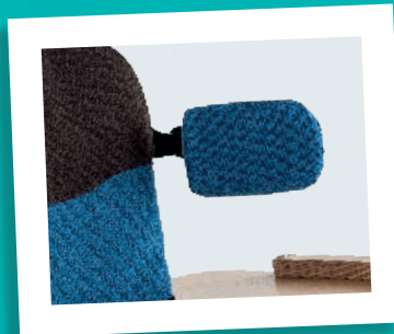
Flip-away PU chest laterals (cover included)