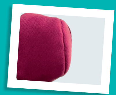
Flat headrest laterals (cover included: Size 1 & 2 only)