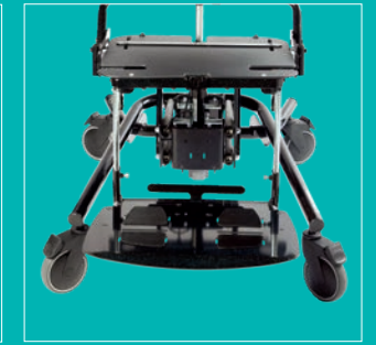
Seat shell on hi-low hydraul chassis with 125mm castors (Size 3 only)