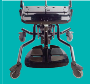
Seat shell on hi-low chassis with 100mm castors (Size 1 & 2 only)