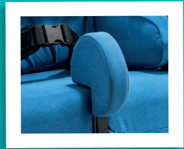
Pommel (cover included)