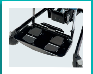
One-piece metal footplate (Size 3 only)