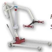
Full body and Sit-to-Stand floor lifts