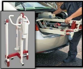
Folds flat for easy transport and storage.