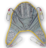
Re-usable and disposable specialty slings