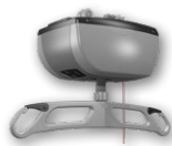
Fixed and portable lithium-ion overhead lifts