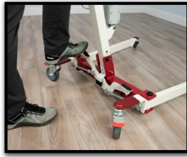
Foot pedal base width adjustment.