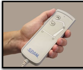
2-button pendant with LED indicator.