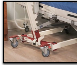
Underbed clearance allows use with most low beds.