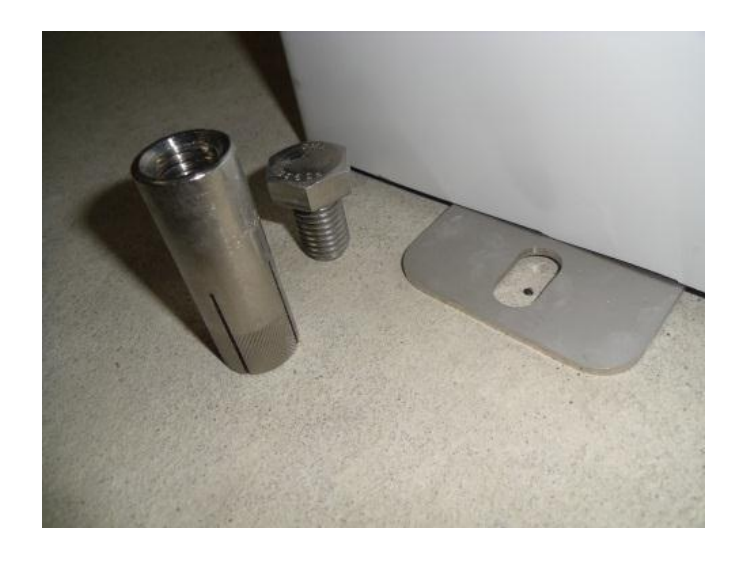
Locate the tab and drop in anchor