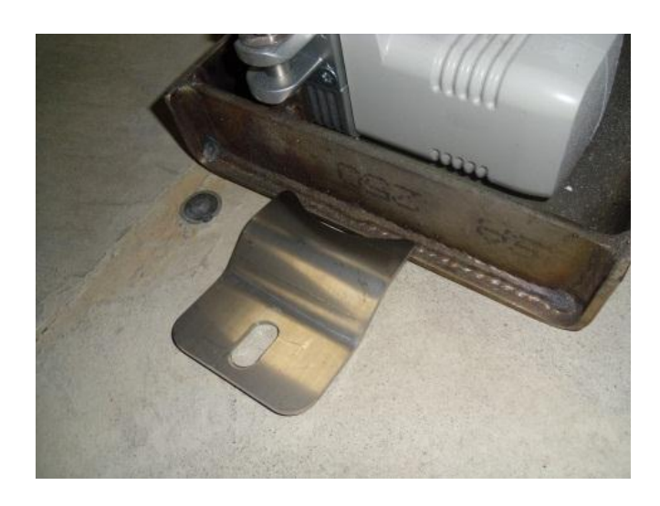
Place the tab on the metal plate