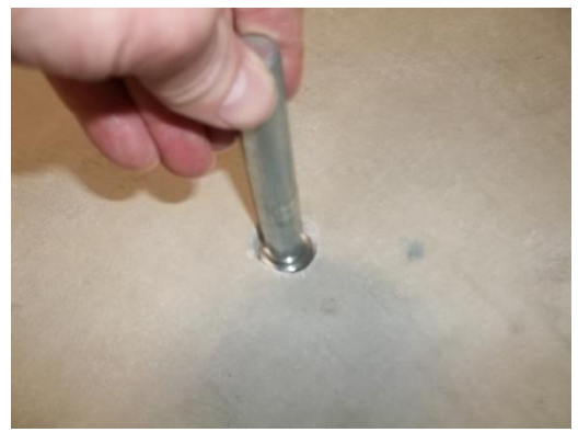
Setting tool shown