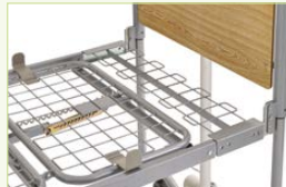
Mattress platform extension – increasing length to 84 inches