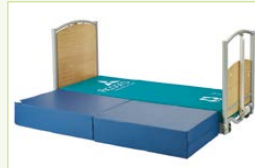
Safety mat provides same height as a FloorBed® with 6 inch foam mattress