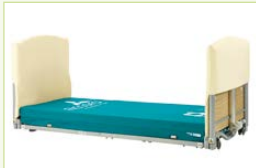
Head and foot board bumpers