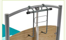
Mattress pump bracket