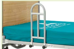
Assist bar to assist with bed mobility