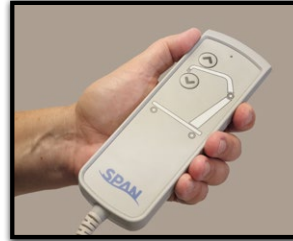
2-button pendant with LED indicator