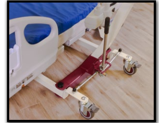
Underbed clearance, allows use with most low beds