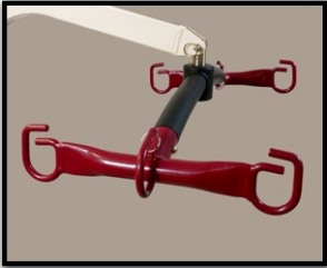
6-point spreader bar maximizes sling options