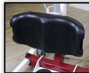
Contoured knee pad with 3 height settings