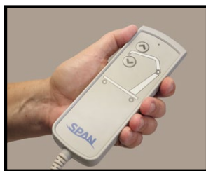
2-button pendant with LED indicator