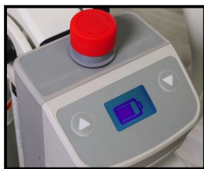
LCD battery level display; audible low-battery indicator