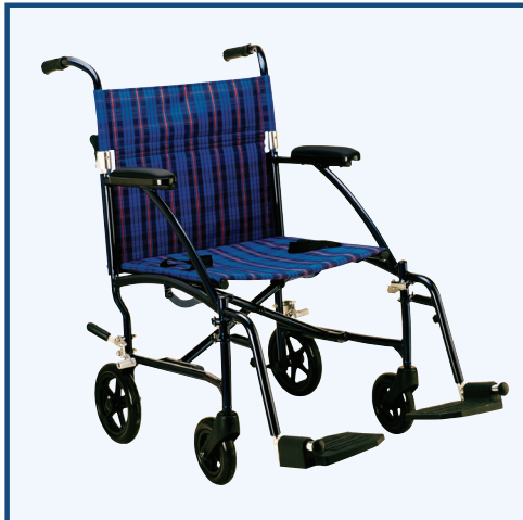
Item # DFL19-BL Shown

It is important for the attendant to be familiar with proper assisting procedures in any situation that requires the use of the Transport Chair. Safety is the Key consideration. Consult your physician, nurse or physical therapist to determine methods most suitable for your individual needs and abilities.