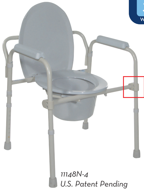
11148N-4 U.S. Patent Pending

Recycled materials were used to make this product.