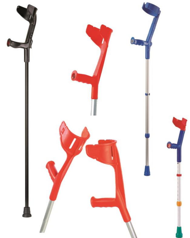
Shown is a selection from our product range.