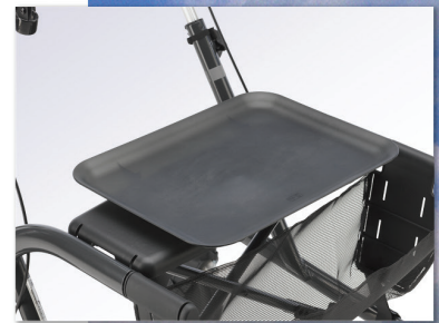
TRAY WITH RAISED EDGES

Accessories personalize the Gloss for each person's unique needs. A Tray with raised edges to carry beverages or food. The Brake Booster provides a greater surface area to push the looped handle. Slow-Down Brakes have a tension control for each wheel to slow rotation and help control rollator. Several One-Hand Brake options can control all braking from one side. An Oxygen Tank Holder will safely support an O2 tank. Cane holder can secure a cane or crutch to the frame. Under Seat Cloth Bag can carry personal items out-of-site.